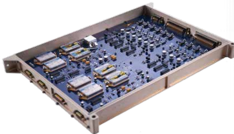
PDM-15 Power Distribution Board without controller

Note: All specifications are subject to change without notice. Rev. 140514